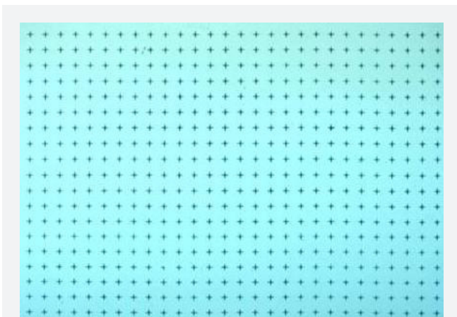
Fig. 2. The grid used for the point counting technique. A point counting grid with 6 mm between the plusses was superimposed over the drawing to assess the projection area of the mandible.

To measure edema after the surgical extraction of the third mandibular molar teeth, posteroanterior skull radiographs taken before and after the operation on the 1 st , 3 rd and 7 th days were evaluated. The lines passing the midsagittal plane, and those passing through both of the mastoid processes on horizontal plane were drawn as well as the lateral bony and soft tissue margins of the mandible on the posteroanterior radiographs (Fig. 1). The area between the bone and the soft tissue margins was measured by point counting technique in square centimeters, which was repeated at one week intervals for 3 times and arithmetic mean values were calculated (Fig. 2).