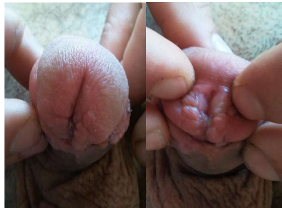
Fig. 3A, B. The appearance of the distal urethral meatus after operation.