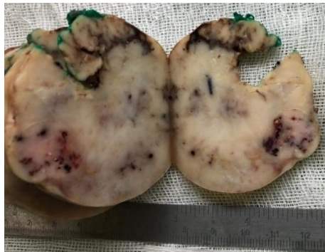
Figure 1. Macroscopic view of material: Heterogeneous cross-sectional area, hemorrhagic mass, hard elastic consistency

Vimentin showed strong diffuse positivity. CD34, DOG1 and smooth muscle actin (SMA) were negative. A well-seperated second tumor consisting hypocellular collagenous stromal proliferation of fibroblasts and myofibroblasts forming short fascicles with mild atypia was detected (Figure 3a).