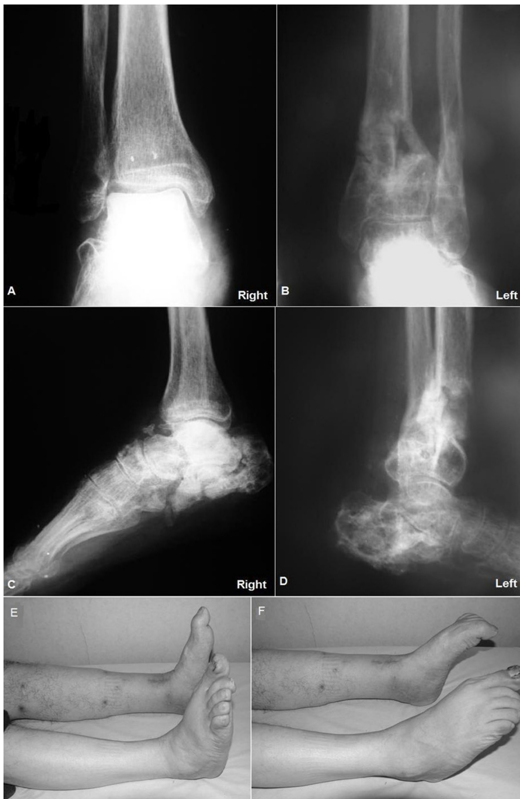
Figure 3 Radiographs (A-D) and clinical pictures (E, F) at the end of the first postoperative year.