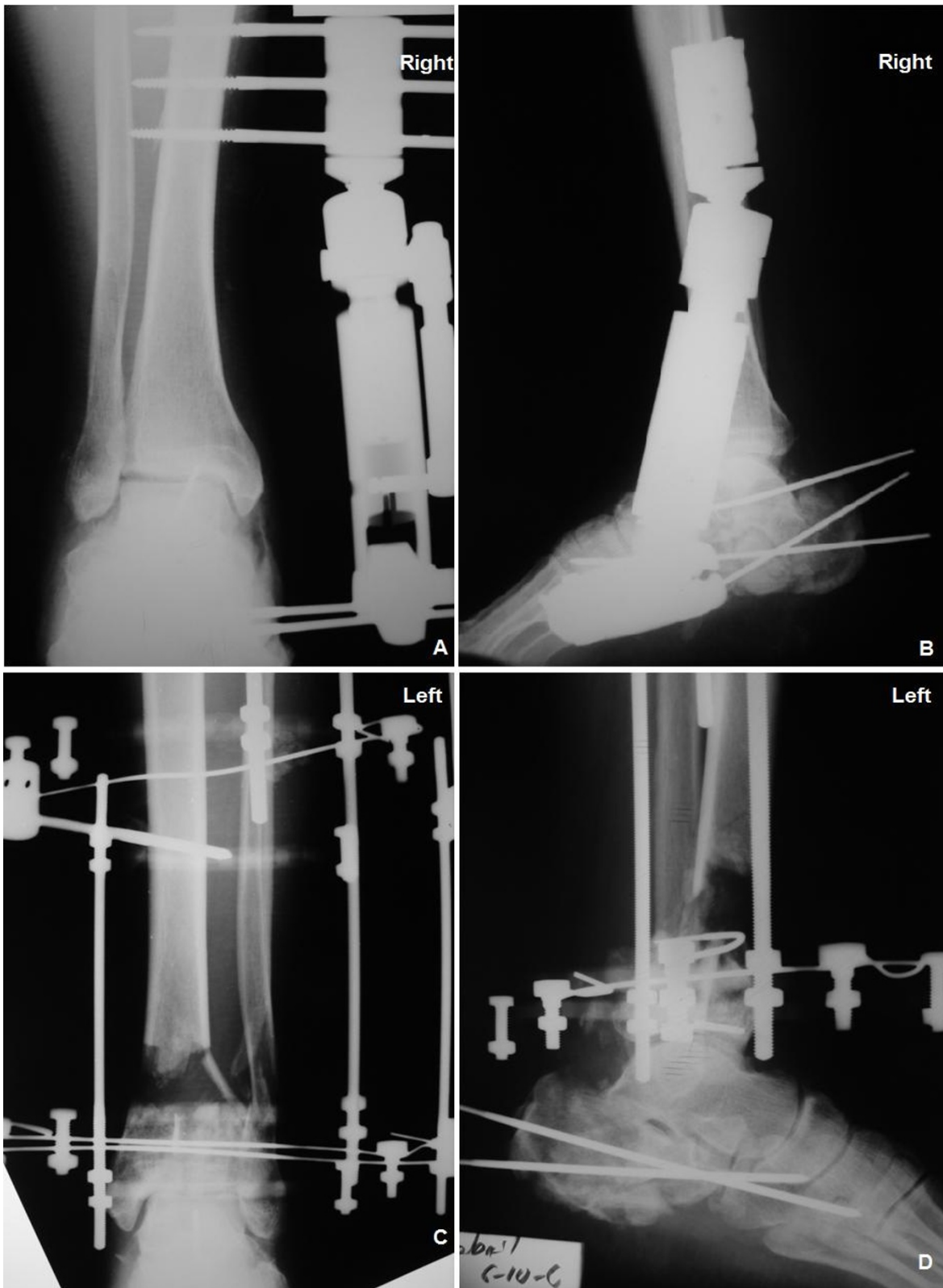
Figure 2 Early postoperative anteroposterior and lateral radiographs of both feet.